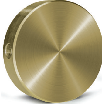
Not actual size, please see dimensions below.

The MicroDisc is a surface temperature probe attachment designed to be used with the MadgeTech LyoTemp, HiTemp140-FP or HiTemp140X2-FP data loggers. Made of C46400 brass, this rugged disc probe attachment is designed to connect directly to the tip of the thermistor probe.